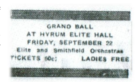
"The Logan Republican on September 21, 1916"

Hyrum Historic Preservation Commission - In anticipation of the 100-Year Anniversary of the Elite Hall, the Hyrum Historic Preservation Commission is kicking-off fundraising efforts to restore the exterior of Elite Hall! If you are interested in helping or donating, please contact Jami at museum@hyrumcity.com. We are looking for individuals who are interested in marketing, planning, and promoting fundraising events and other efforts.